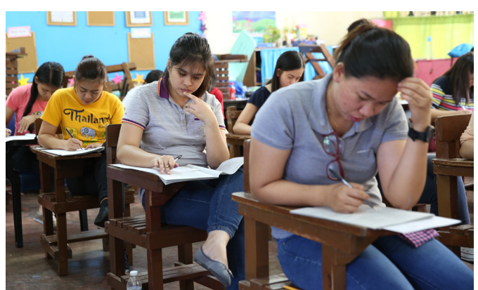
Exam hopefuls take the pen-and-paper test held on March 12, 2017.

he next Career Service Examination, Pen and Paper Test (CSE-PPT) for Professional and Sub-professional levels will be conducted on August 6, 2017.